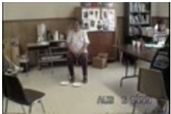
Tatitlek Afternoon 19990806 (CM0097)