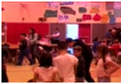
Tatitlek Culture Week May 2006 (CM0634)