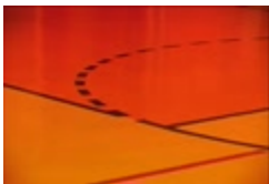
Tatitlek Culture Heritage Night (CM0639)