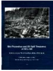
Site Protection and Oil Spill Treatment at SEL-188: An Archaeological Site in Kenai Fjords National Park, Alaska (BA339)