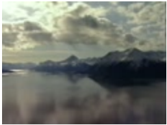
Alutiiq Pride - A Story Of Subsistence - VHS (CM0020)